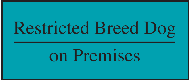
Figure 2. Example warning sign

For details of suppliers of Restricted Breed Dog signs, contact your local council, or phone the DPI Customer Service Centre on 136 186.