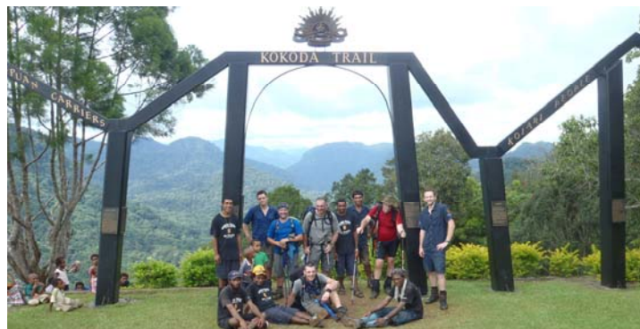
At Ower's Corner at end of our trek

high-fives, pics and then celebration with some cognac and beer. That night we had a celebratory dinner with our guides and porters. I am currently reading A Field Guide To Kokoda and Peter Fitzsimons' Kokoda.