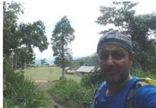
Entering Ioribaiwa Village

shoulder to the mountains and hills we had trekked over the last 8 days with disbelief. We all walked up to the threshold and paused in a line before walking through at the same time. It still stirs emotion in me thinking of that moment. A lot of