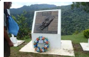
Memorial Plaque at Ower's Corner

..from p1. At the end of the trek on the 8th day, we were on our final climb (around 45 minutes – an hour). We were all very tired by now. We followed the narrow path zigzagging to the top of Ower's Corner. On the final turn, we were presented with the Kokoda Trail archway and the ANZAC emblem on top. It was the most amazing sight and quite humbling. I looked over my