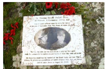
Bisset Memorial Plaque