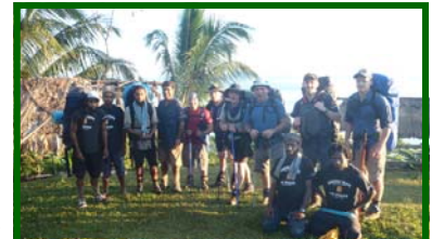
At Deniki Village Day 2

Whilst the trek for me was extreme, it pales compared to the things the Aussie diggers had to endure. I went with my best mate, his son and two others through a company called No Roads Expeditions. We arrived on 23 April and stayed at The Holiday Inn. On Anzac Day we went to the dawn service at Bomana cemetery. Very moving indeed.