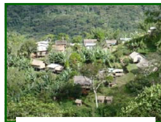
Alola Village Day 3

After the service we went to the Australian High Commission for a gunfire breakfast then back to the hotel to grab our gear and fly in to Kokoda. Out trek had begun. Numerous emotional moments along the track when we came upon battle sights with memorial plaques and details of heroic acts. We also took with us as a group notepads, calculators, glow sticks etc for the school kids at Kagi Village. After dinner that